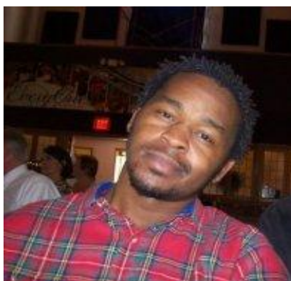
Vincent De Paul

Many international students in the U.S. haven't had the chance I've had to hear the Word and hold on to Jesus.