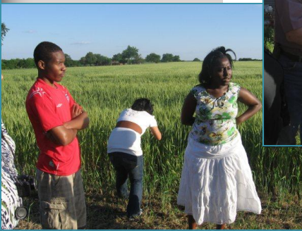
The Norman Farm